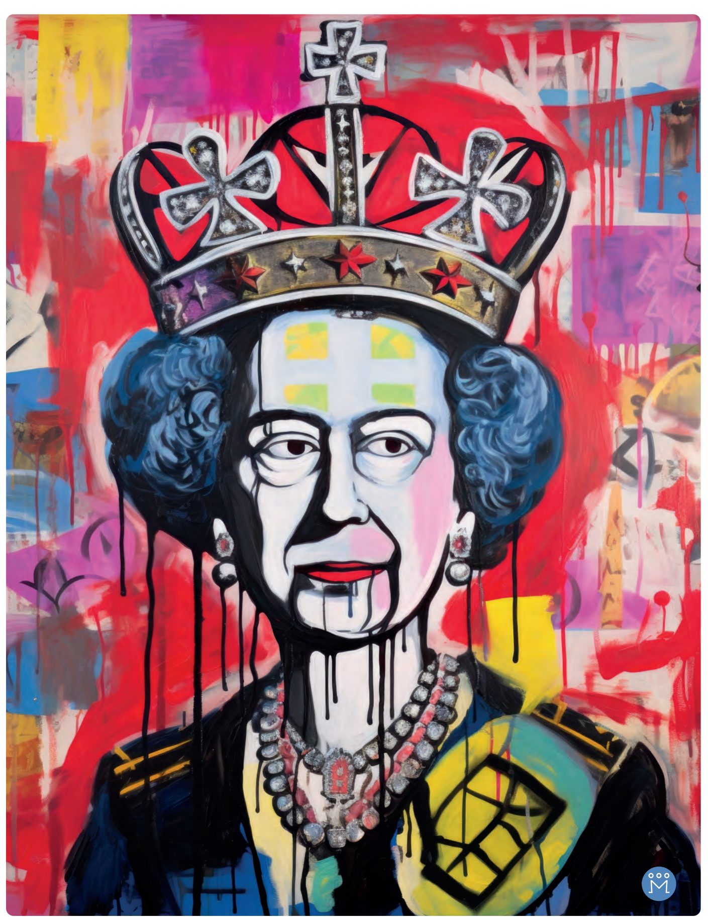
Never Mind the Bollocks, Here's the Sex Pistols (1977) / God Save the Queen