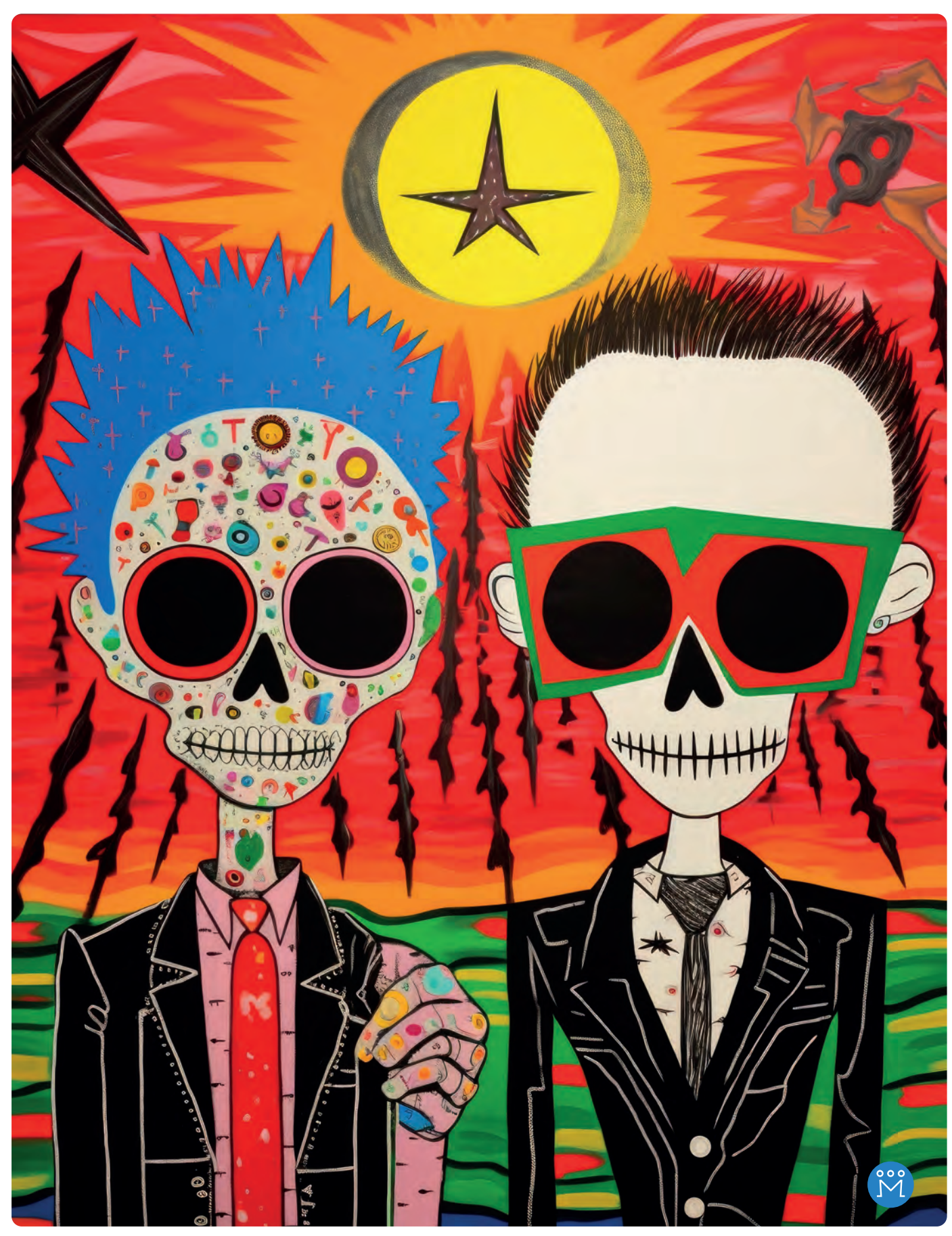
Never Mind the Bollocks, Here's the Sex Pistols (1977) / {f Holidays} in the {f Sun}