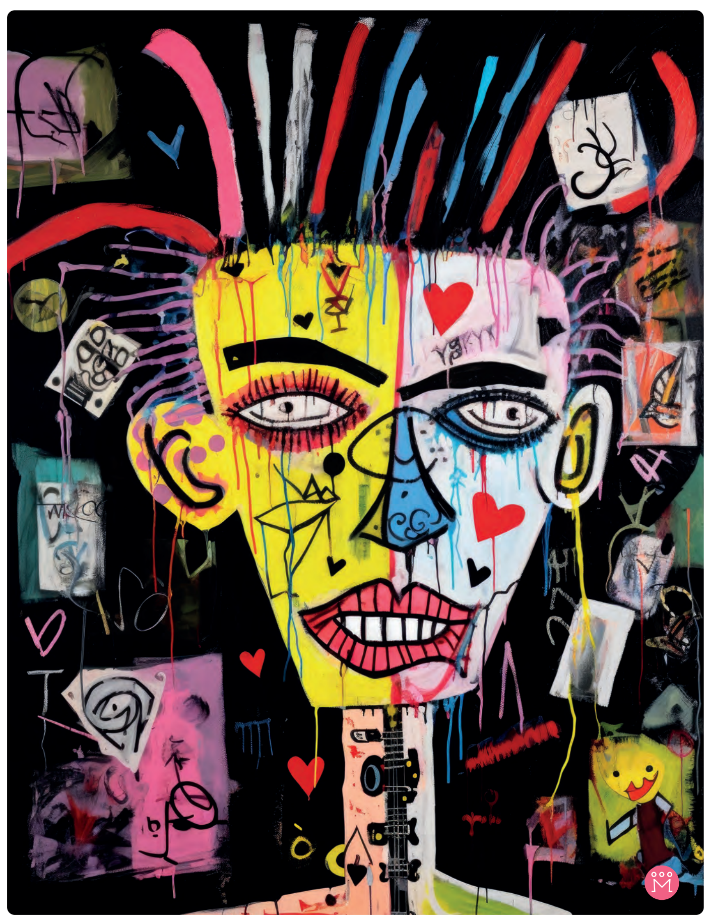
Never Mind the Bollocks, Here's the Sex Pistols (1977) / No Feelings