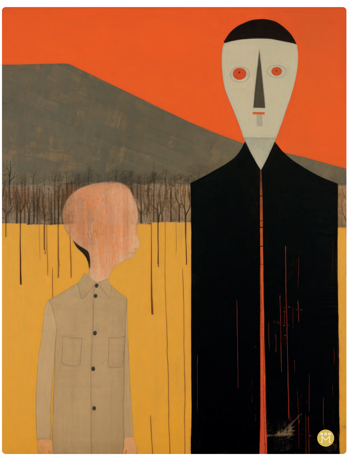
Unknown Pleasures (1979) / New Dawn Fades