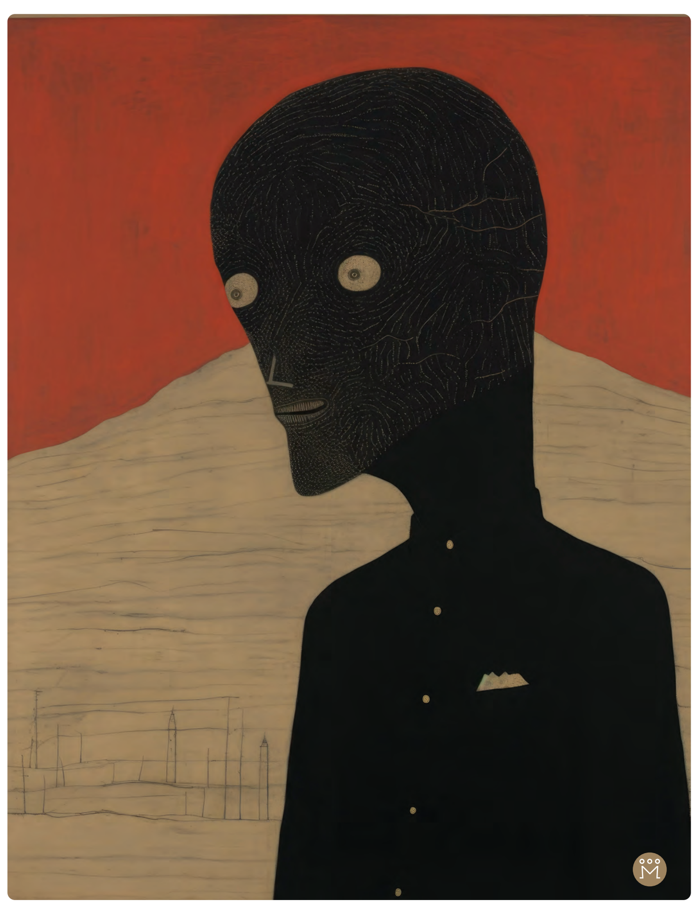
Unknown Pleasures (1979) / Disorder