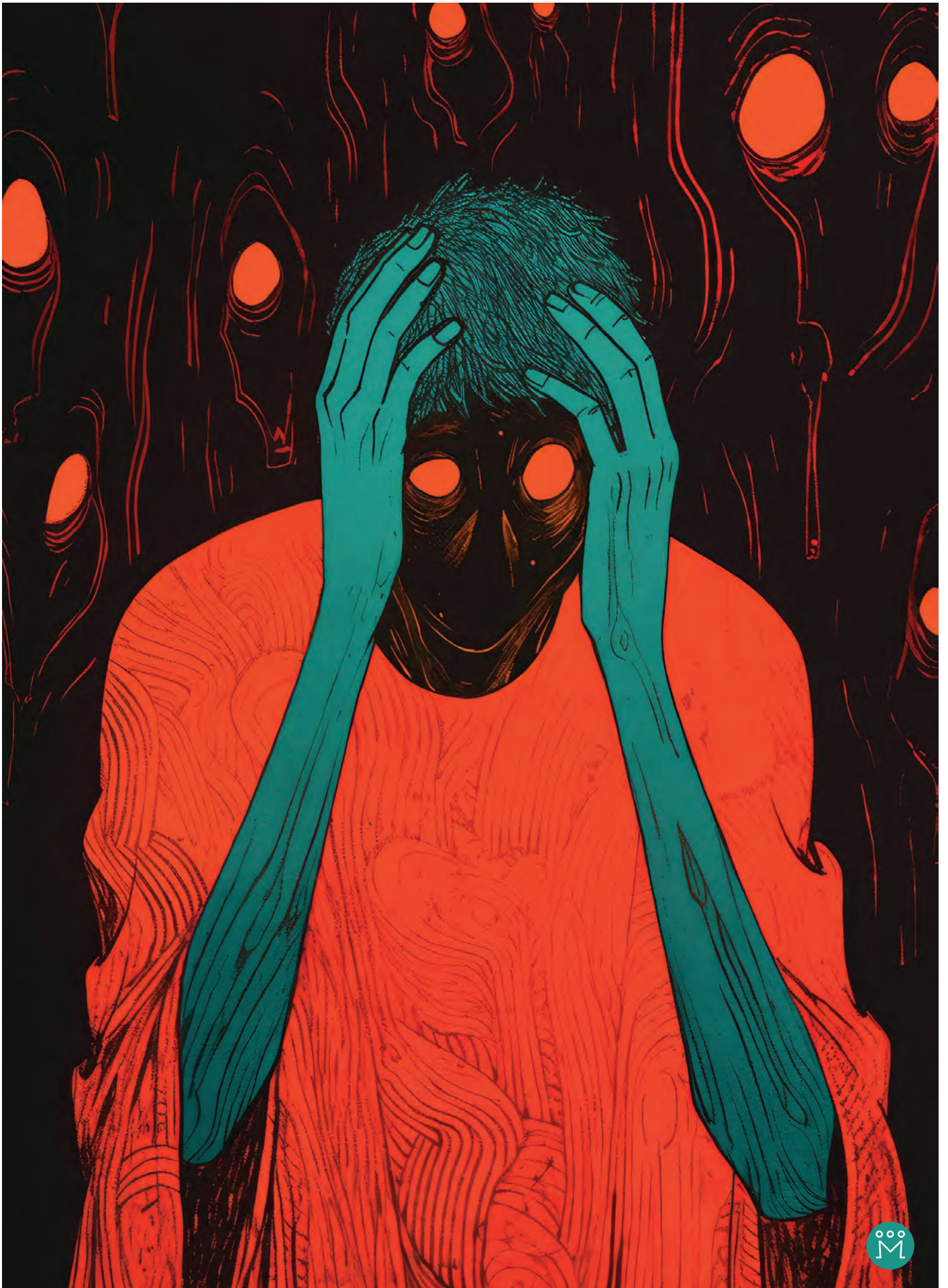
From Genesis to Revelation (1969) / Am I Very Wrong?