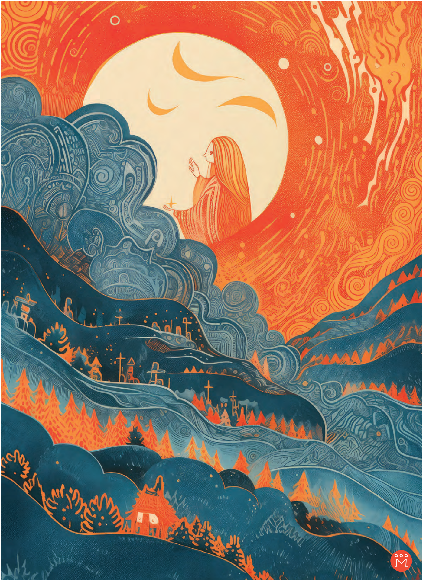
From Genesis to Revelation (1969) / Where the Sour Turns to Sweet