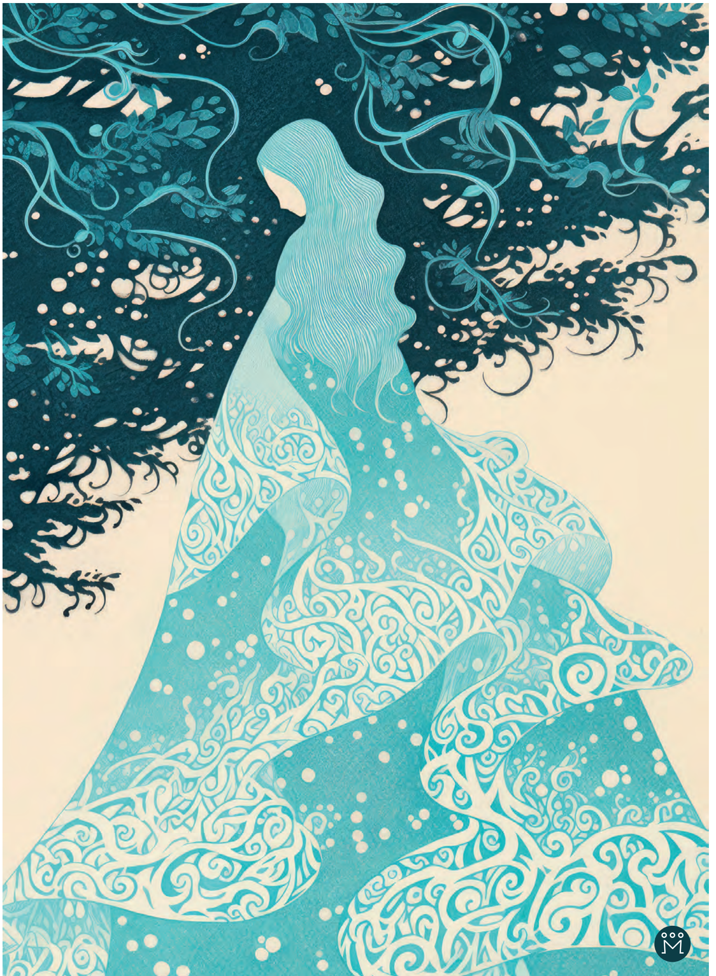
From Genesis to Revelation (1969) / In the Beginning