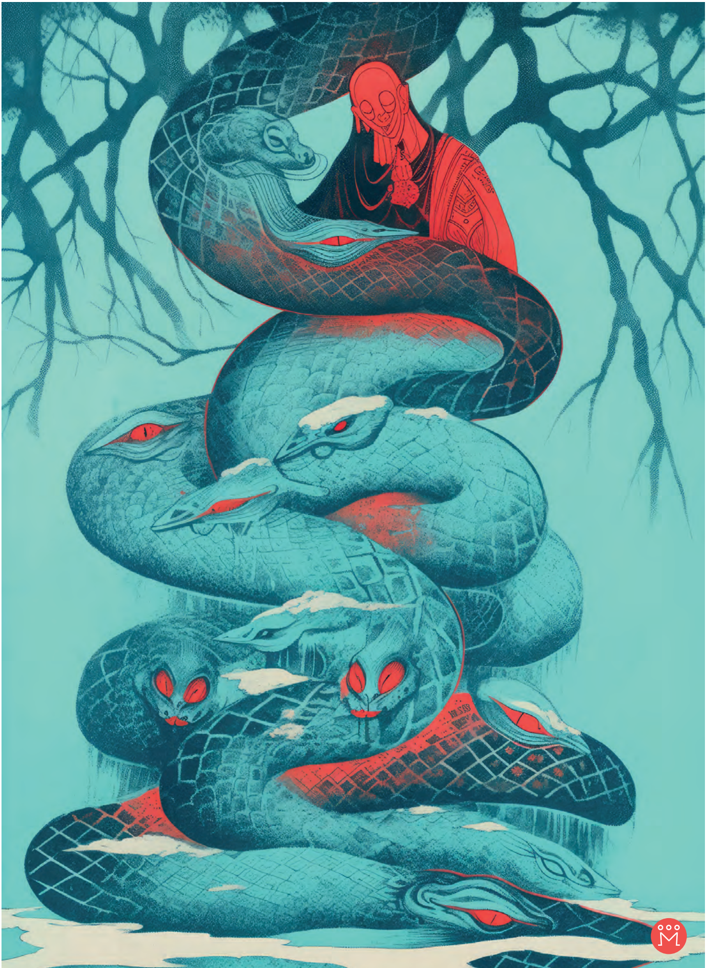
From Genesis to Revelation (1969) / The Serpent