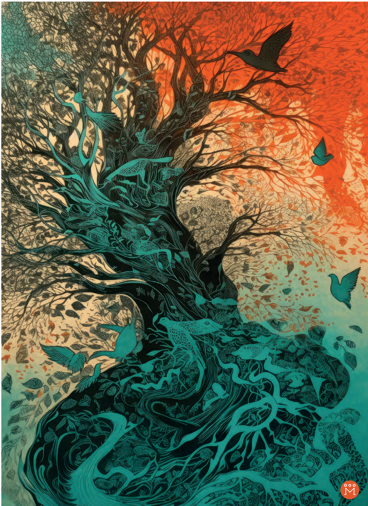
From Genesis to Revelation (1969) / Where the Sour Turns to Sweet